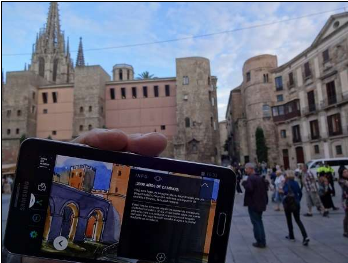
Picture 3. Visualization and interpretation of the Roman walls.