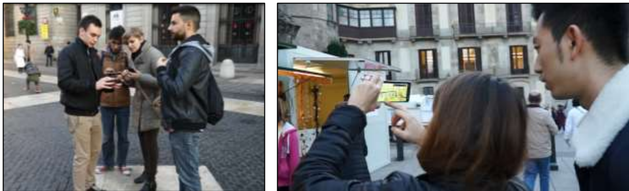
Pictures 6 & 7. Usability test of the application in the historic quarter of Barcelona.

first technique is widely used in the field of web design, in order to identify problems of information architecture, web design or functions, while the second, is more used in the field of social sciences and enables one to acquire additional information about problems, experiences and user desires. A qualitative questionnaire was designed in order to measure user satisfaction in both the above mentioned cases.