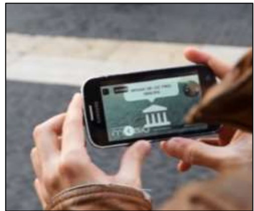
Pictures 4 & 5. Visualization of educational tools with the use of augmented reality radar.